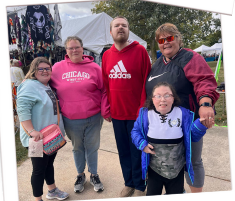
SOAR Group Respite Trips