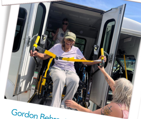
Gordon Behrents Senior Center