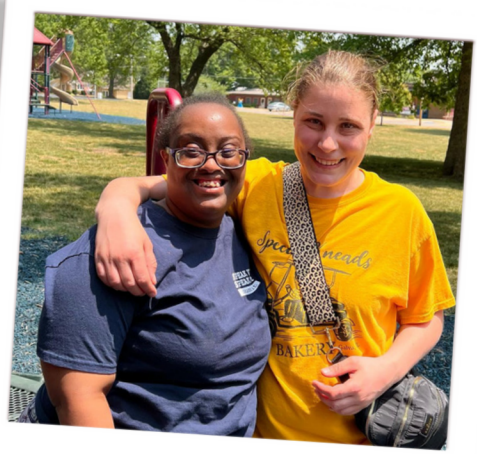
Community Day Services