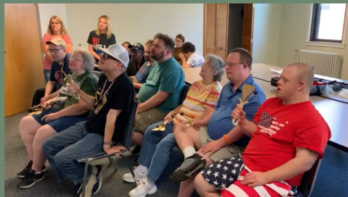
BELLS CASPI CLASS

CASPI classes are offered to clients at KCCDD and change each quarter. If an individual has a special interest in something, KCCDD can probably offer a class for them. These classes are always favorites among the clients because they get to explore topics they've never been able to before, or they get to further explore something they know they love!